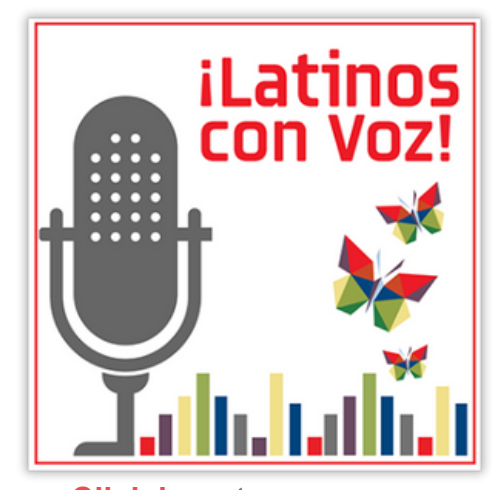
Click here to access our ¡Latinos con Voz! Podcast series

Community Conversations on Mental Health: Participate in our community-driven discussions to address mental health concerns, break the stigma, and promote help-seeking behaviors.